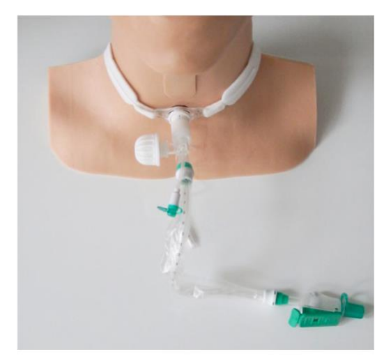
Figure above. The Kelley circuit with a closed-circuit suction system attached to the ISO 15 hub of the tracheostomy tube and the ProTrach XtraCare attached to the ventilator hub on the side.